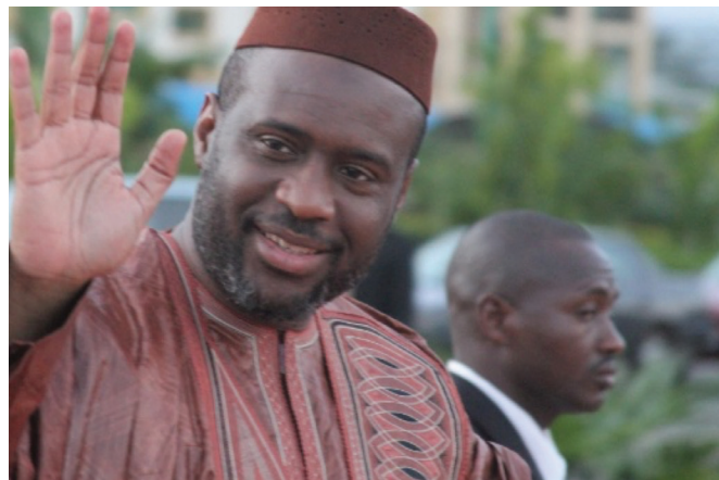
Former Malian Prime Minister Moussa Mara.

The deterioration in security has unfolded in the context of a systematic tightening of political and civic space by the junta since it seized power. Promises of a transition back to civilian rule have been repeatedly postponed. Prominent civilian figures, including the secular moderate former Prime Minister Moussa Mara, have been detained or sidelined after calling for a return to constitutional governance. This narrowing of political space has limited avenues for addressing governance challenges all the while