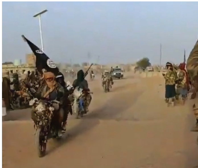
JNIM forces entering Kidal. (Screen capture)

For the FLA, the recapture of Kidal reflects a continued effort to reassert control over the north following the Malian junta's decision to end the Algiers Accord and take Kidal by force in November 2023. The move by the junta to open a second front against the Tuareg, instead of focusing on the militant Islamist threat elsewhere, resulted in dramatically overstretched military supply lines amid an already resource constrained environment.