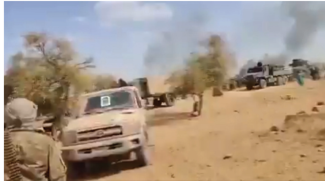
Russian paramilitary forces retreating from Kidal following FLA attacks. (Screen capture)

The attacks disprove claims long made by the military junta that their security strategies have stabilized Mali. Instead, they point to a widening gap between the Sahelian juntas' claims and the conditions on the ground. Furthermore, the intensive Russian-sponsored information operations—extolling Russia's successes and those of the Sahelian juntas in combatting the violent extremist insurgencies—have provoked a parallel battle of narratives throughout West Africa, irrespective of the security realities.