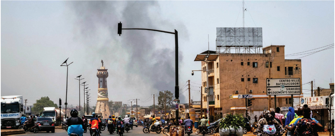
A column of black smoke rises over Bamako in the aftermath of the April 25 attacks.

The synchronized militant Islamist and separatist attacks across Mali reflect a steady deterioration in security that will require a broader coalition of domestic, regional, and international partners to reverse.