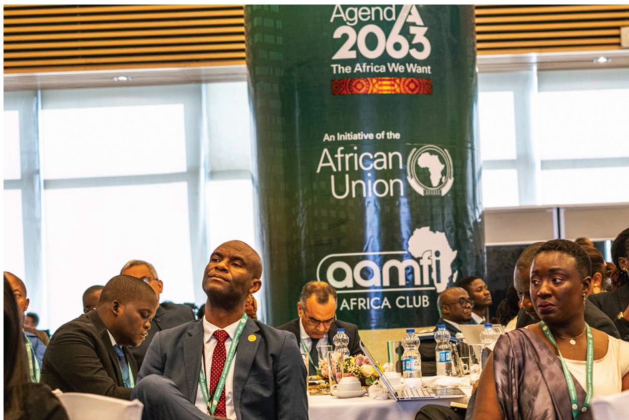
Delegates attend an Agenda 2063 conference during the African Union Summit, February 16, 2025.

Agenda 2063 represents a continuation and consolidation of earlier frameworks: the Lagos Plan of Action (1980–2000) and the 2002 Strategic Vision for Africa, which laid the foundations for the Conference on Security, Stability, Development and Cooperation in Africa.