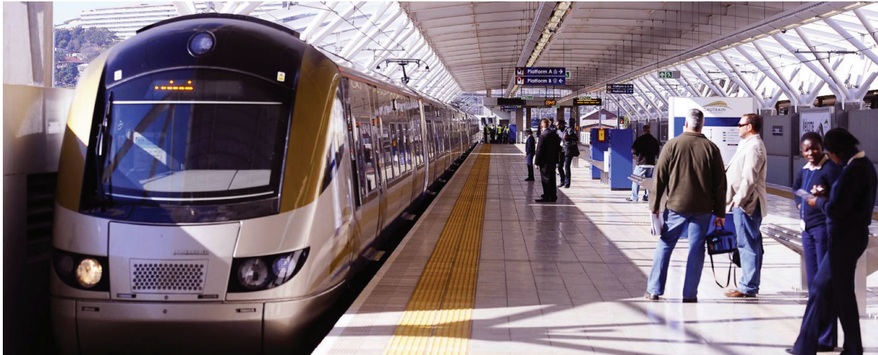
The Gautrain, Africa's first high-speed rail line, in Pretoria, South Africa.

The African Union's ambitious vision of citizen-focused development, infrastructural and institutional innovation, and sustained peace and security provides a template to harmonize intra- and interregional strategies.