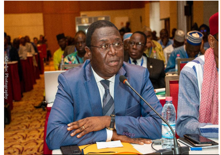
PRESIDENT, BENINESE SUPREME COURT