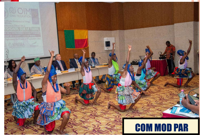
COM MOD PAR