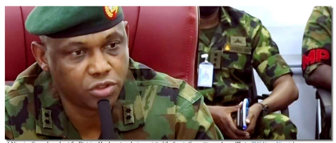
A Nigerian General speaks at the Division Headquarters during a visit of the Senate Committee on Army.

Parliamentary committees that oversee the security sector play an essential role in building accountable, sustainable, transparent, and professional institutions.