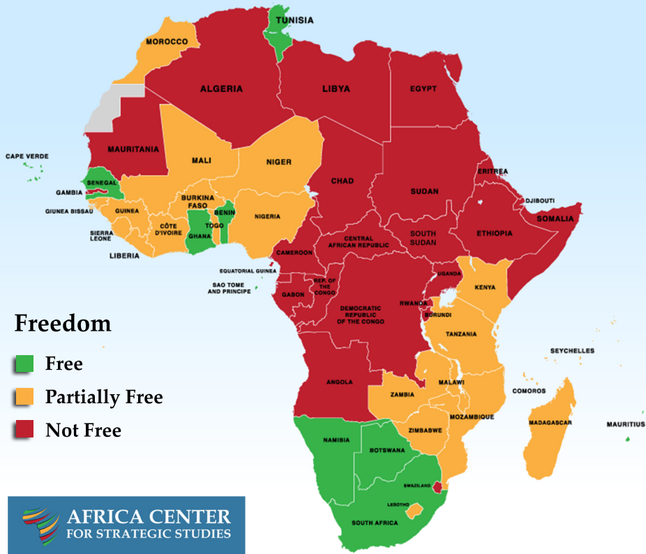
Source: Data from Freedom House