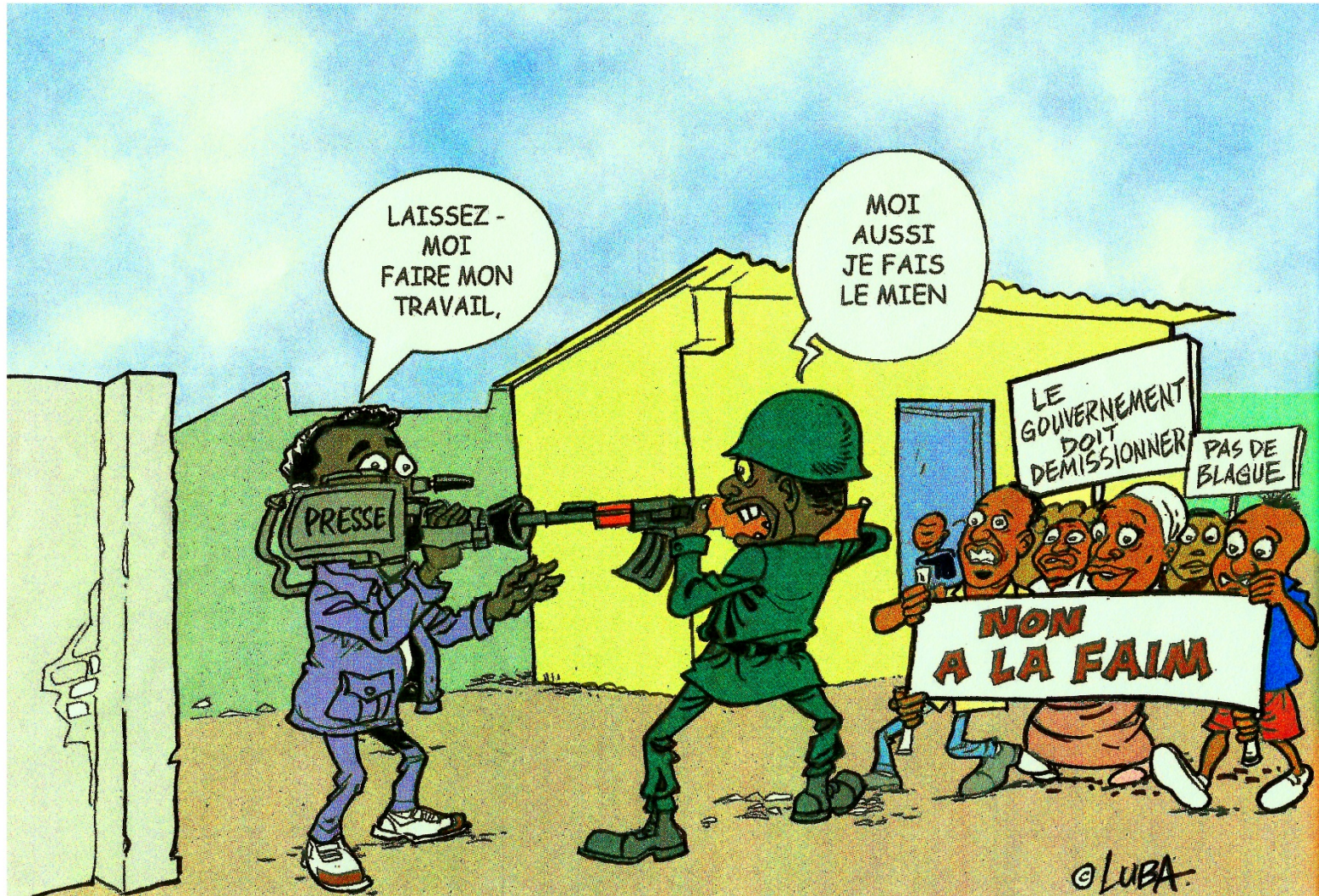
LUBA Dessinateur, Caricaturiste / ADEP / Kinshasa