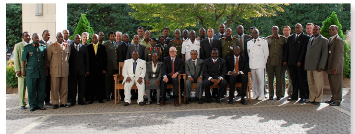
Group photo of Managing Security Resources in Africa participants

Resource scarcity during bleak economic times is the best opportunity for countries to become more efficient at conducting the business of government, the head of the Africa Center for Strategic Studies (ACSS) said during opening remarks for the organization's annual Managing Security Resources in Africa Seminar.