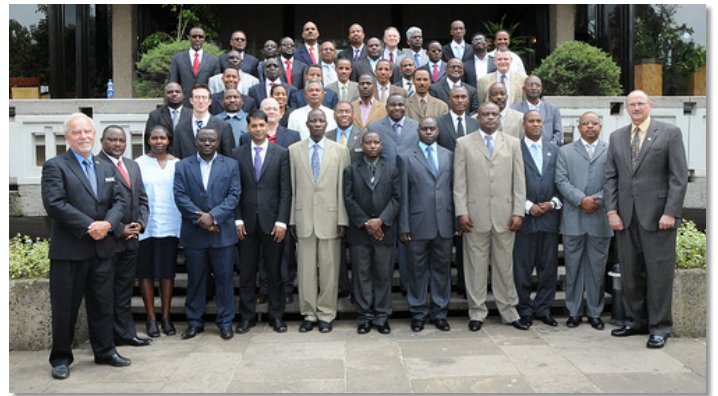
Security Sector Reform seminar attendees pose for group photo