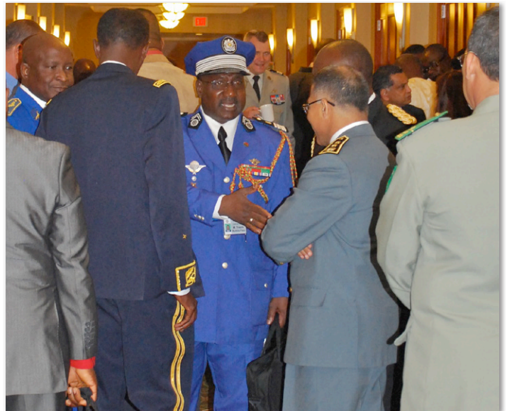
2011 Senior Leaders Seminar participants greet one another before the first plenary session