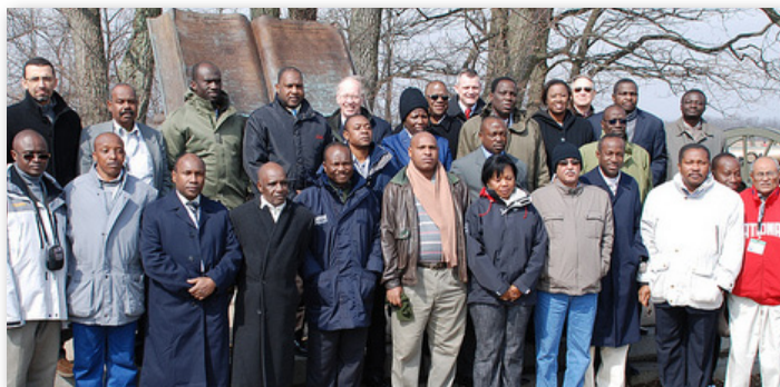
French-speaking participants attending the Next Generation Course take a moment for a group photo in front of one of the many monuments honoring the soldiers who fought at Gettysburg on July 1-3, 1863

The 40 participants attending this year's Africa Center for Strategic Studies' Next Generation of African Security Sector Leaders Course traveled to Pennsylvania on March 22 to visit the Gettysburg National Military Park and U.S. Army War College at Carlisle Barracks.